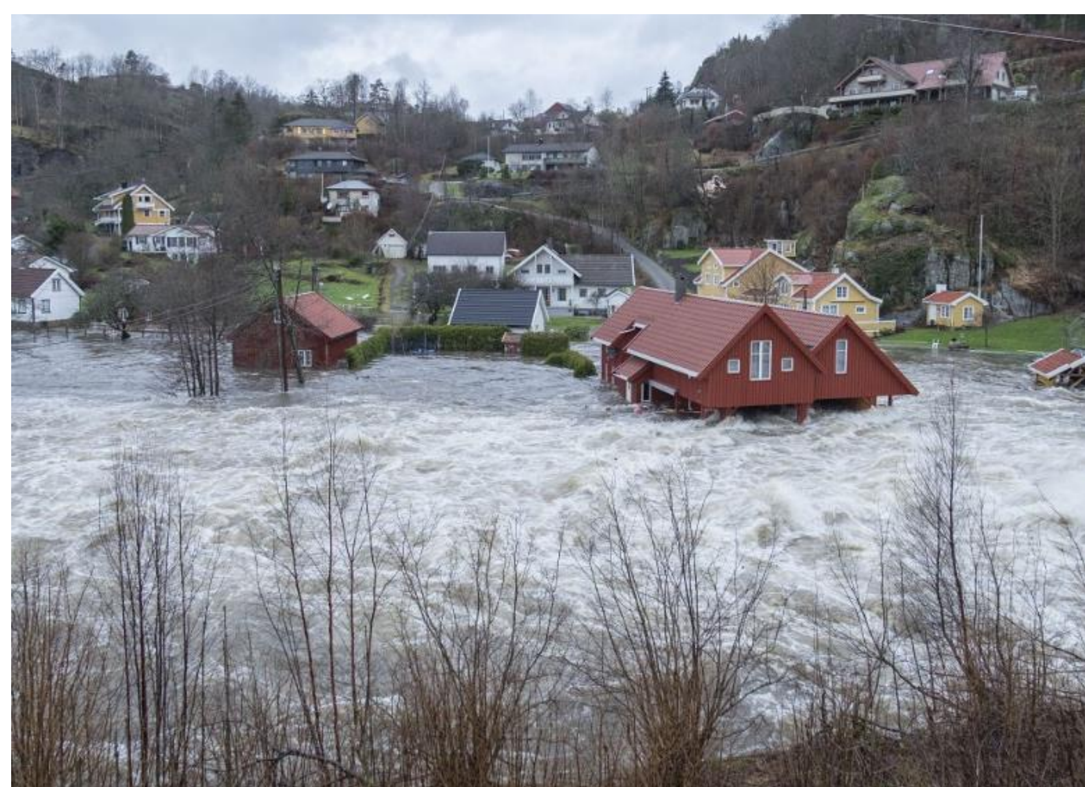
Consequences of the extreme weather "Synne" in Rogaland, Norway in December 2015.